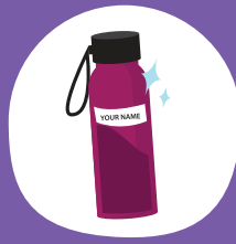
Personal water bottles