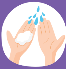
Hand washing or sanitizing