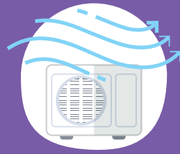
Airflow and Circulation